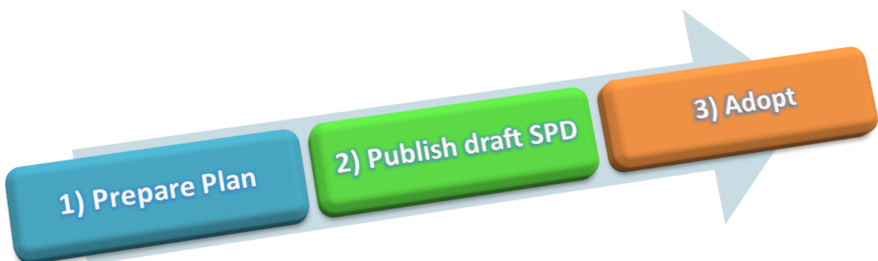
Figure 3: Stages in Supplementary Planning Documents

4.13 Figure 3 below identifies the stages used in the preparation of Supplementary Planning Documents. References to regulations relate to the Town and Country Planning (Local Planning) (England) Regulations 2012.