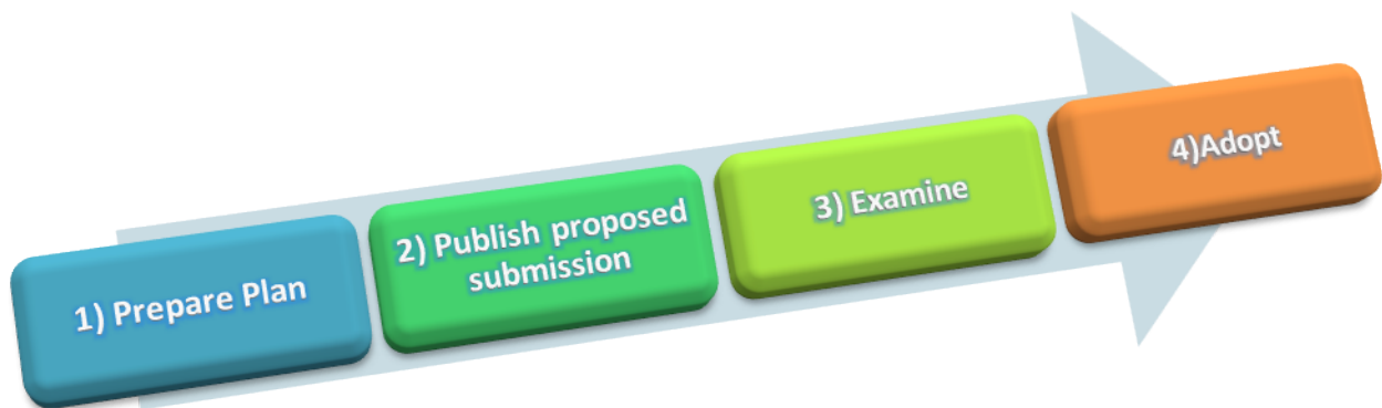
Figure 2: Stages in preparing the Local Plan